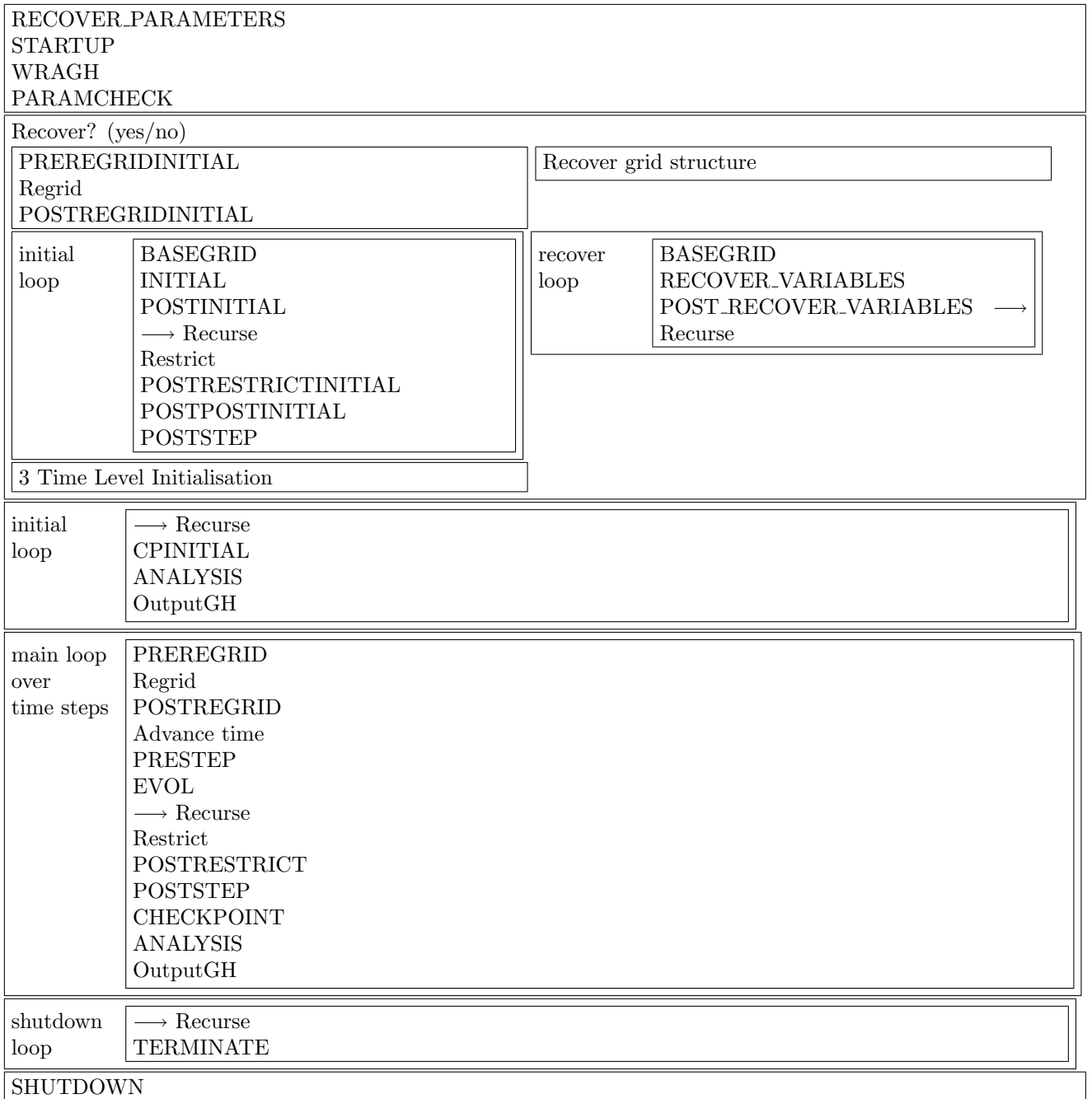
Figure 4: This figure gives an outline of how Carpet uses the Berger-Oliger algorithm to sequence through the schedule bins and grids. See figure 5 for a (much!) more detailed description of the algorithm. In general, all the loops are traversed in the order from coarse grids to fine grids. FIXME: ARE THERE EXCPETIONS TO THIS RULE (AMONG THE LOOPS SHOWN IN THIS FIGURE)?